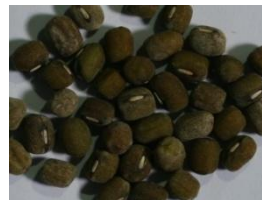
Dull, yellowish green (F 2 )