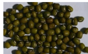
Shiny, yellowish green (F 2 )