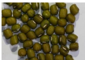
Shiny, yellowish green (Berken)