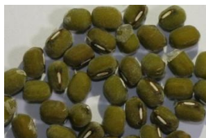
Dull, dark green (DX92-1)